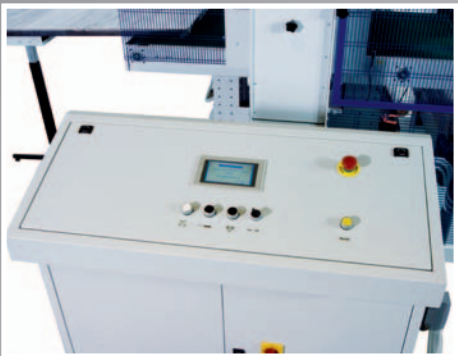
From the panel the functions are controlled through the PLC, used to regulate all variable parameters and select one of the 6 banding programs.

顶部和底部动力覆膜膜架根据产品长度自动控制膜的长度, 也特别适用在轻型的产品因为我们采用顺和轻柔的覆膜方式