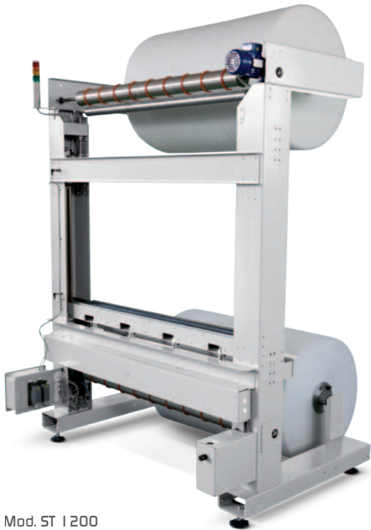
Mod. ST 1200