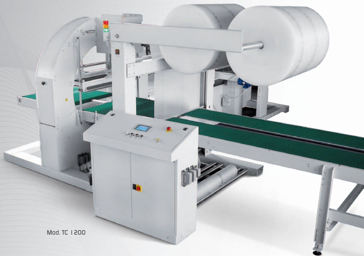
Mod. TC 1200

Automatic Packaging System, low-power consumption, for a total closure of the package (without shrink tunnel) using spools of polyethylene (PE) or air bubble + stretch film.