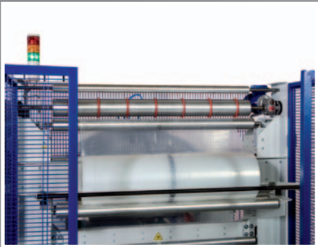
Top and bottom motor driven film spools Provides maximum control on the quantity of film used on the product. They are also useful for lightweight products, because they provide smooth transition through the wrapping machine.

顶部和底部动力覆膜膜架根据产品长度自动控制膜的长度, 也特别适用在轻型的产品因为我们采用顺和轻柔的覆膜方式