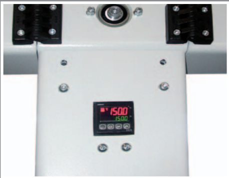
Digital keypad for sealing bar temperature settings. 数字面板显示封口温度和设置温度

TC 300 TC 600 TC 900 TC 1200 TC 1500 TC 1800 TC 2200 TC 2500